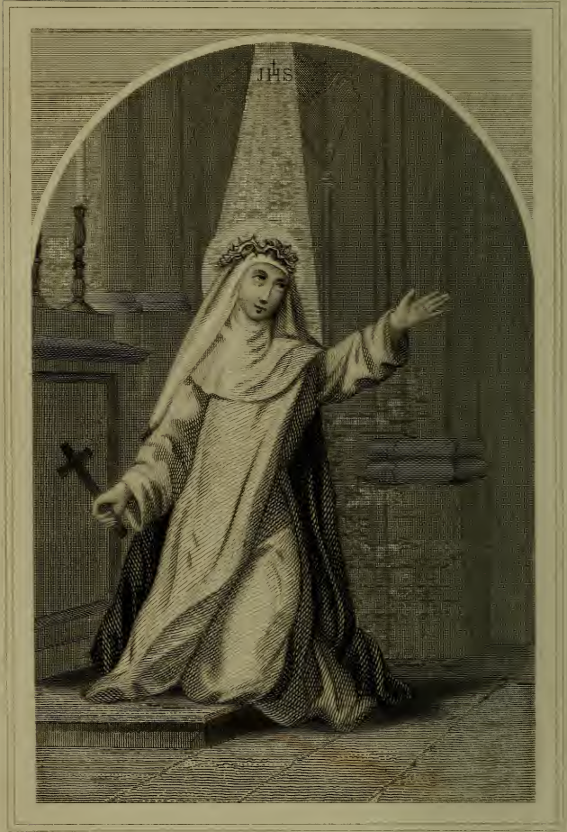
SAINT CATHARINE OF SIENNA